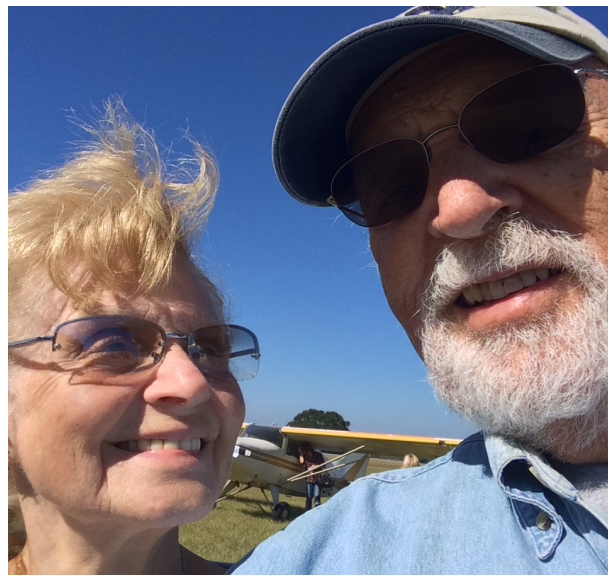
Walking around and seeing stuff